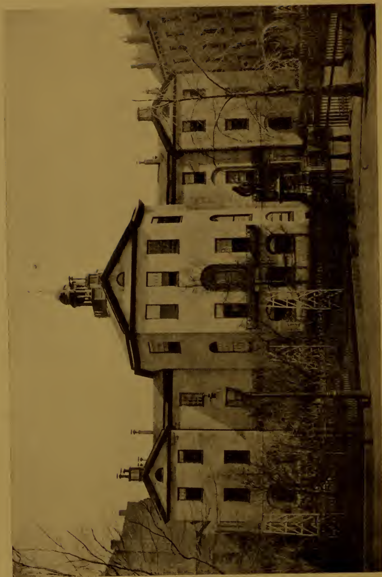
City Hall — 1840-1860. View in 1858